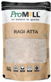
FINGER MILLET FLOUR