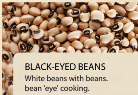
BLACK-EYED BEANS White beans with beans. bean 'eye' cooking.