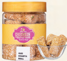
Gud Khasta Roll