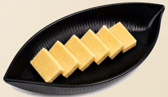
Fresh Khoya (Milk Solids)