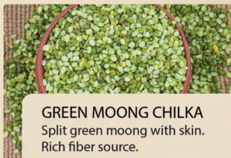
GREEN MOONG CHILKA Split green moong with skin. Rich fiber source.