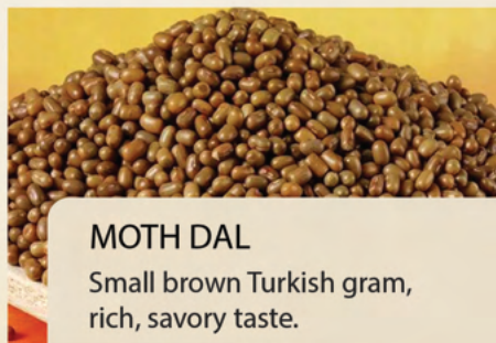
MOTH DAL Small brown Turkish gram, rich, savory taste.