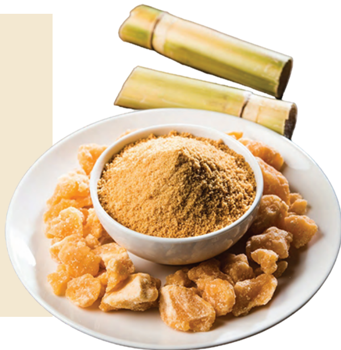
Organic Jaggery (Whole & Powdered)