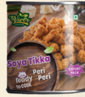
Peri Peri Soy Tikka