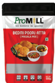
BEDMI POORI ATTA (MASALA MIX)