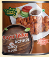
Achari Soya Tikka