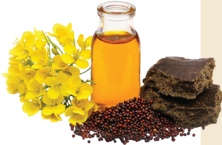
Pure Mustard Oil