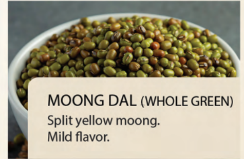
MOONG DAL (WHOLE GREEN) Split yellow moong. Mild flavor.