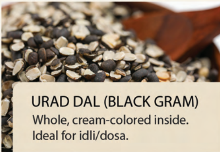
URAD DAL (BLACK GRAM) Whole, cream-colored inside. Ideal for idli/dosa.