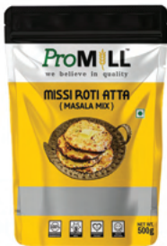
MISSI ROTI ATTA (MASALA MIX)