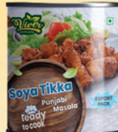
Punjabi Masala Soya Tikka