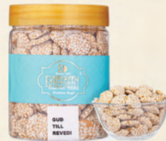
GUD TILL REVEDI