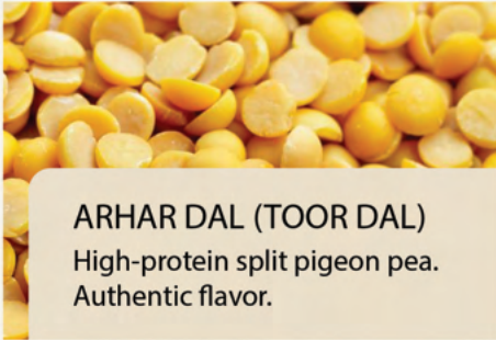
ARHAR DAL (TOOR DAL) High-protein split pigeon pea. Authentic flavor.