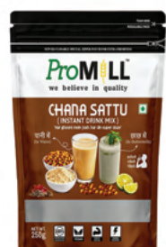
CHANA SATTU (INSTANT DRINK MIX)