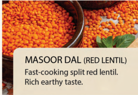
MASOOR DAL (RED LENTIL) Fast-cooking split red lentil. Rich earthy taste.