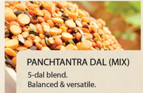
PANCHTANTRA DAL (MIX) 5-dal blend. Balanced & versatile.