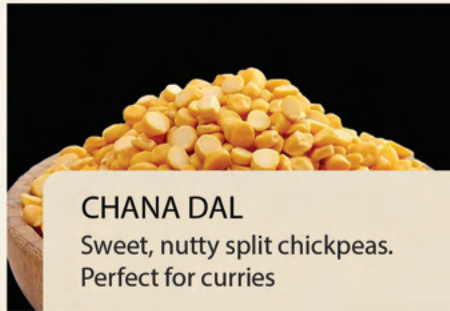
CHANA DAL Sweet, nutty split chickpeas. Perfect for curries