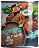
Italian Soya Tikka