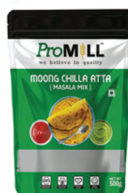
MOONG CHILLA ATTA (MASALA MIX)