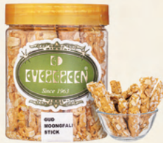
Gud Moongfali Stick