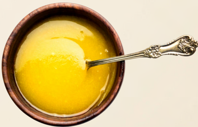
Cow & Buffalo Ghee (Clarified Butter)