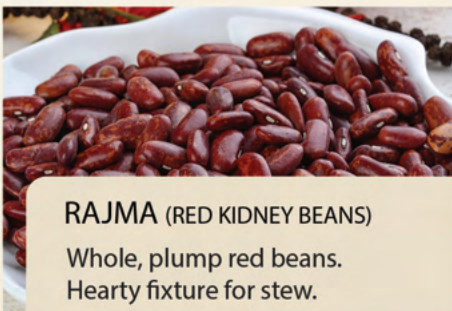
RAJMA (RED KIDNEY BEANS) Whole, plump red beans. Hearty fixture for stew.