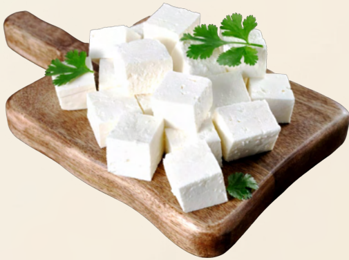
Fresh Malai Paneer (Cottage Cheese)