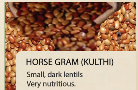
HORSE GRAM (KULTHI) Small, dark lentils Very nutritious.