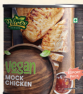
Vegan Mock Chicken