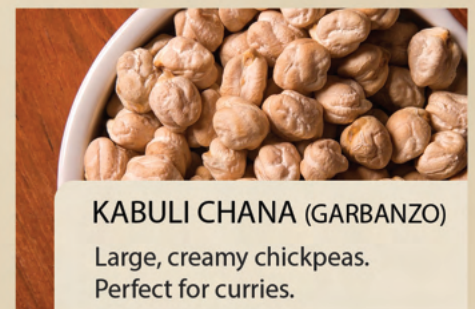
KABULI CHANA (GARBANZO) Large, creamy chickpeas. Perfect for curries.