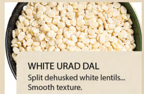
WHITE URAD DAL Split dehusked white lentils... Smooth texture.