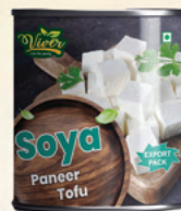
Soya Paneer Tofu