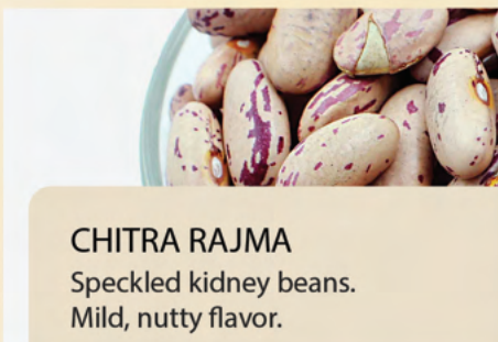
CHITRA RAJMA Speckled kidney beans. Mild, nutty flavor.